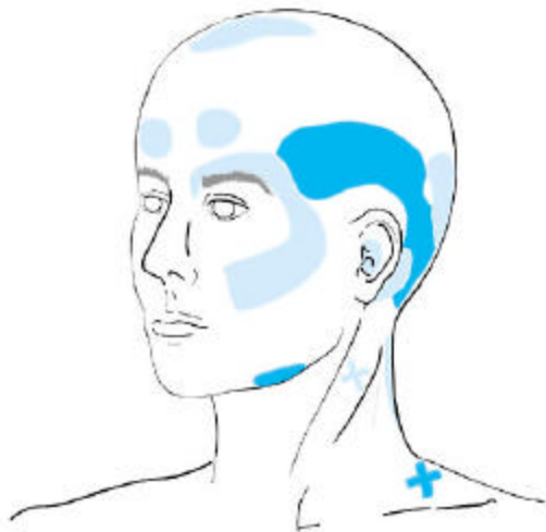
■ Trapezeus trigger point referred pain □ Sternocleidomastoid trigger point referred pain

TDN is a treatment for muscular tightness and spasm which commonly follows injuries and often accompanies the degenerative processes. This muscular tightness and spasm will cause compression and irritation of the nerves exiting the spine. When the nerves are irritated, they cause a protective spasm of all the muscles to which they are connected. This may cause peripheral diagnoses, such as carpel tunnel, tendonitis, osteoarthritis, decreased mobility and chronic pain. Small, thin needles are inserted in the muscles at the trigger points causing the pain referral. The muscles would then contract and release, improving flexibility of the muscle and decreasing symptoms.